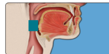
The oropharynx is the area in blue at the back of the tongue and throat.